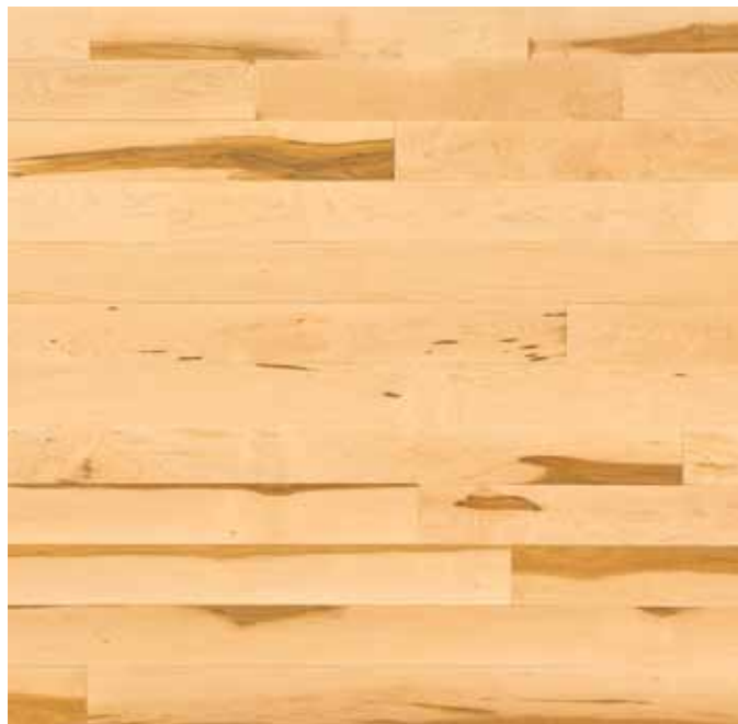
PACIFIC GRADE (solid)