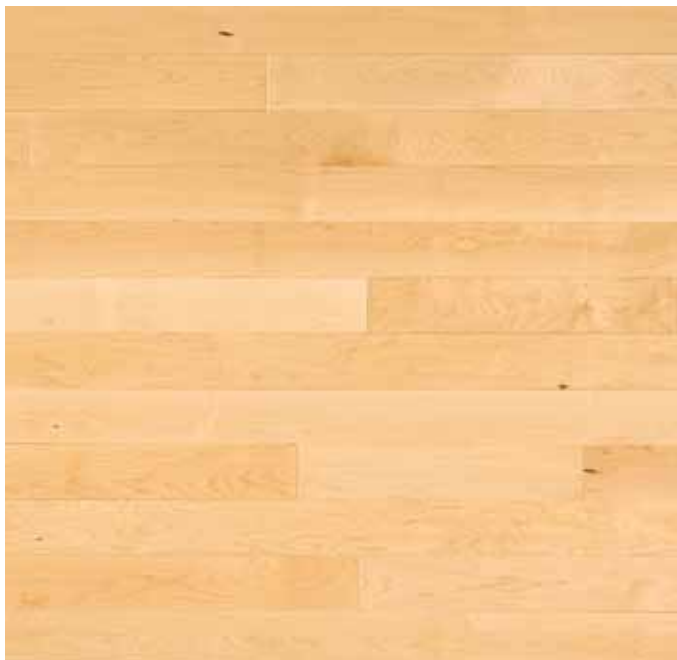
SELECT & BETTER GRADE (solid and engineered)