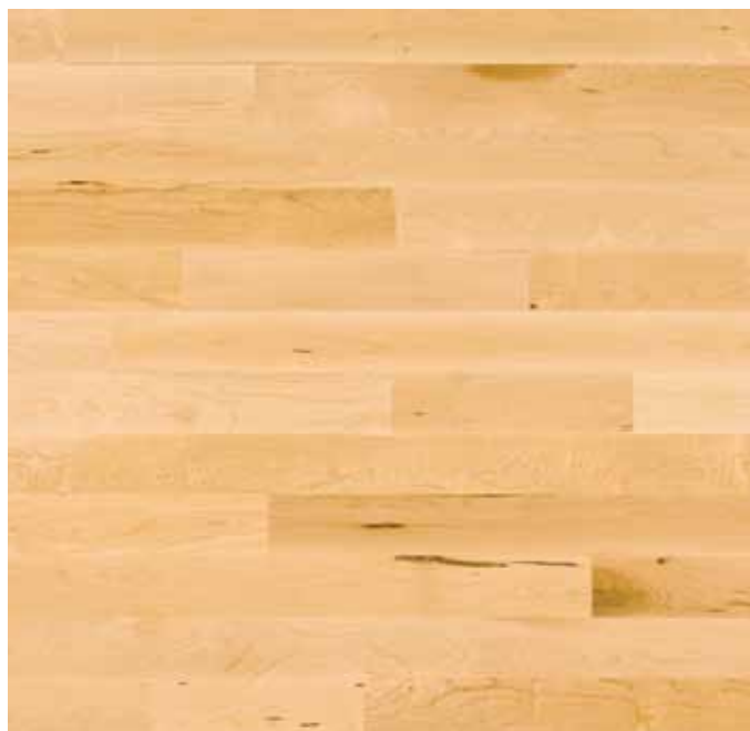
EXCLUSIVE GRADE (engineered)